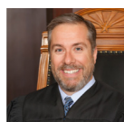
Judge James Beene Arizona Court of Appeals